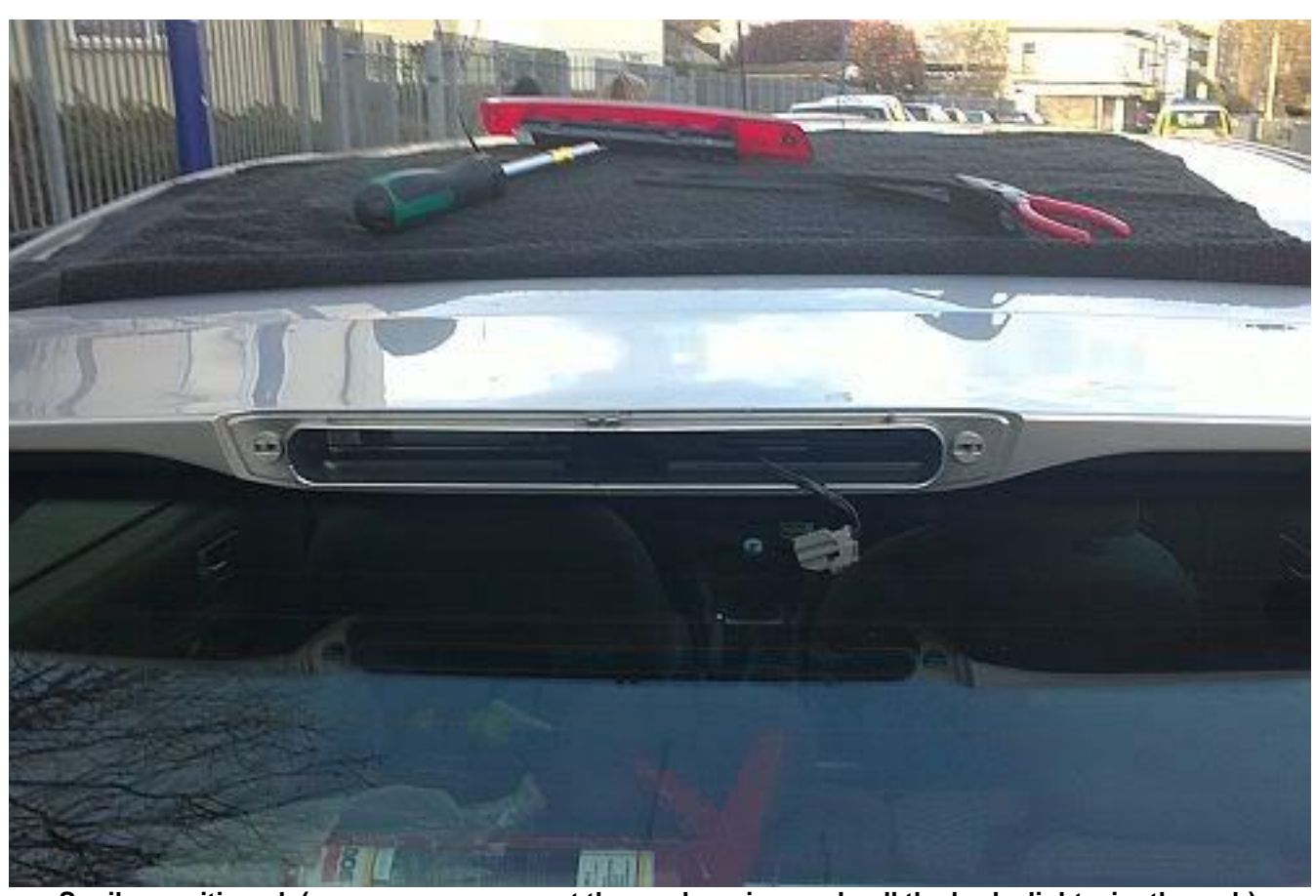
Spoiler positioned, (ensure you reconnect the washer pipe, and pull the brake light wire through)

Press the spoiler to the hatch using the lugs on the spoiler to line it up, this will squash the Silicone around and hopefully seal the holes nicely.