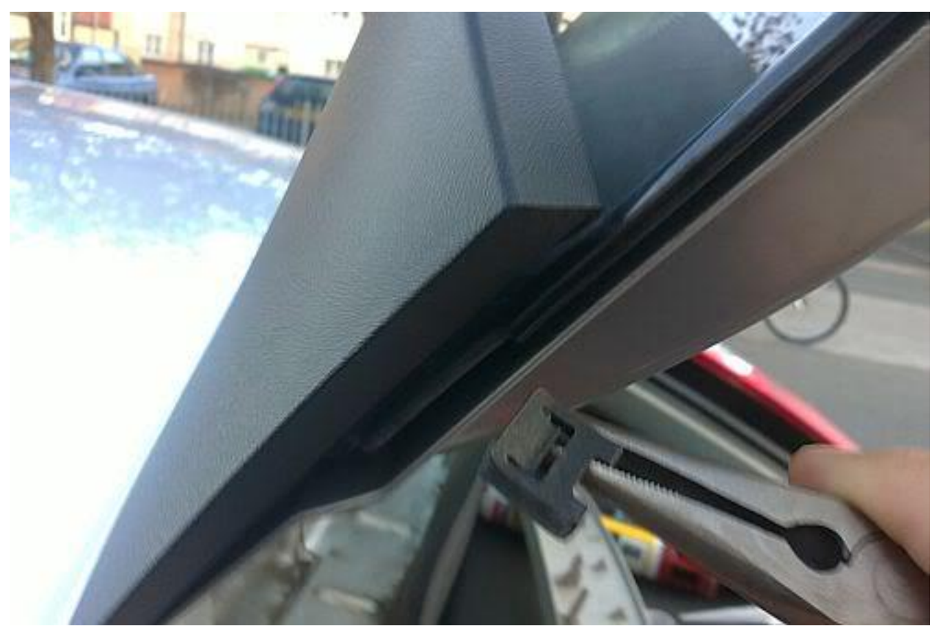
Removing the clips

Next locate the clips at either end of the old spoiler which just pull out quite easily with needle nose pliers, take note of which way up they go.