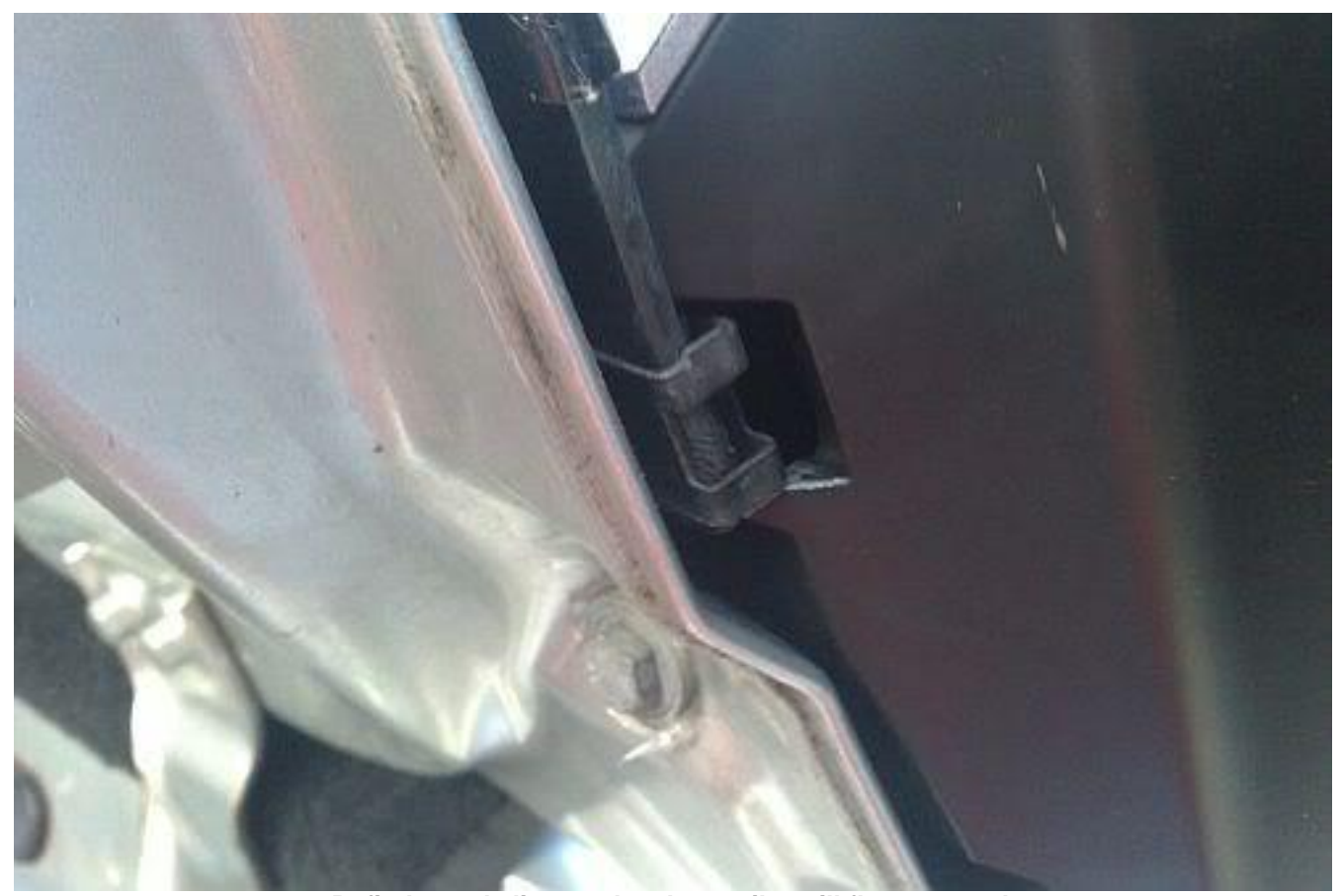
Refit the end clips or else the spoiler will flap at speed

Refit the clips at the ends of the spoiler, an easy push fit - remember which way up?