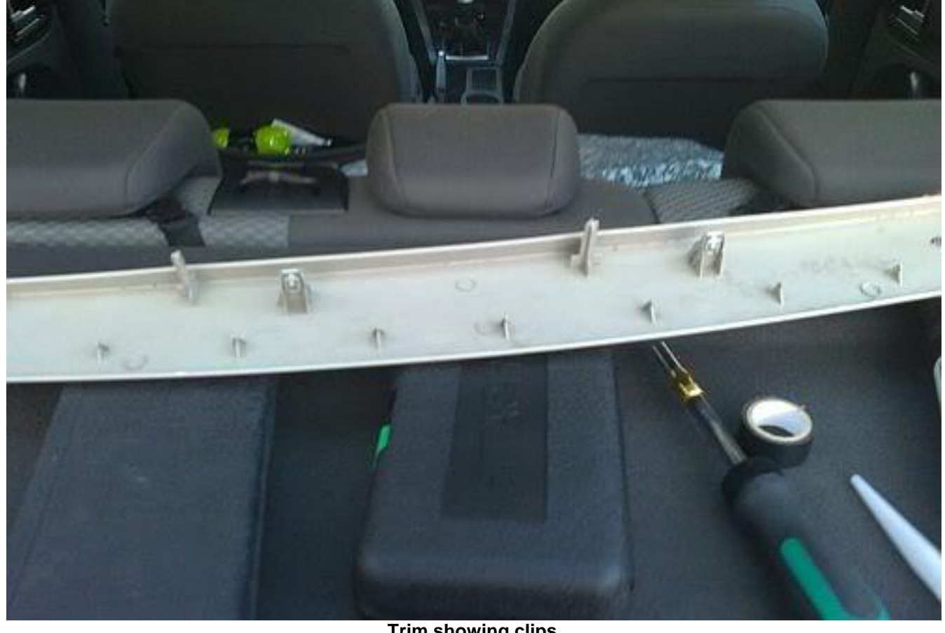
Trim showing clips