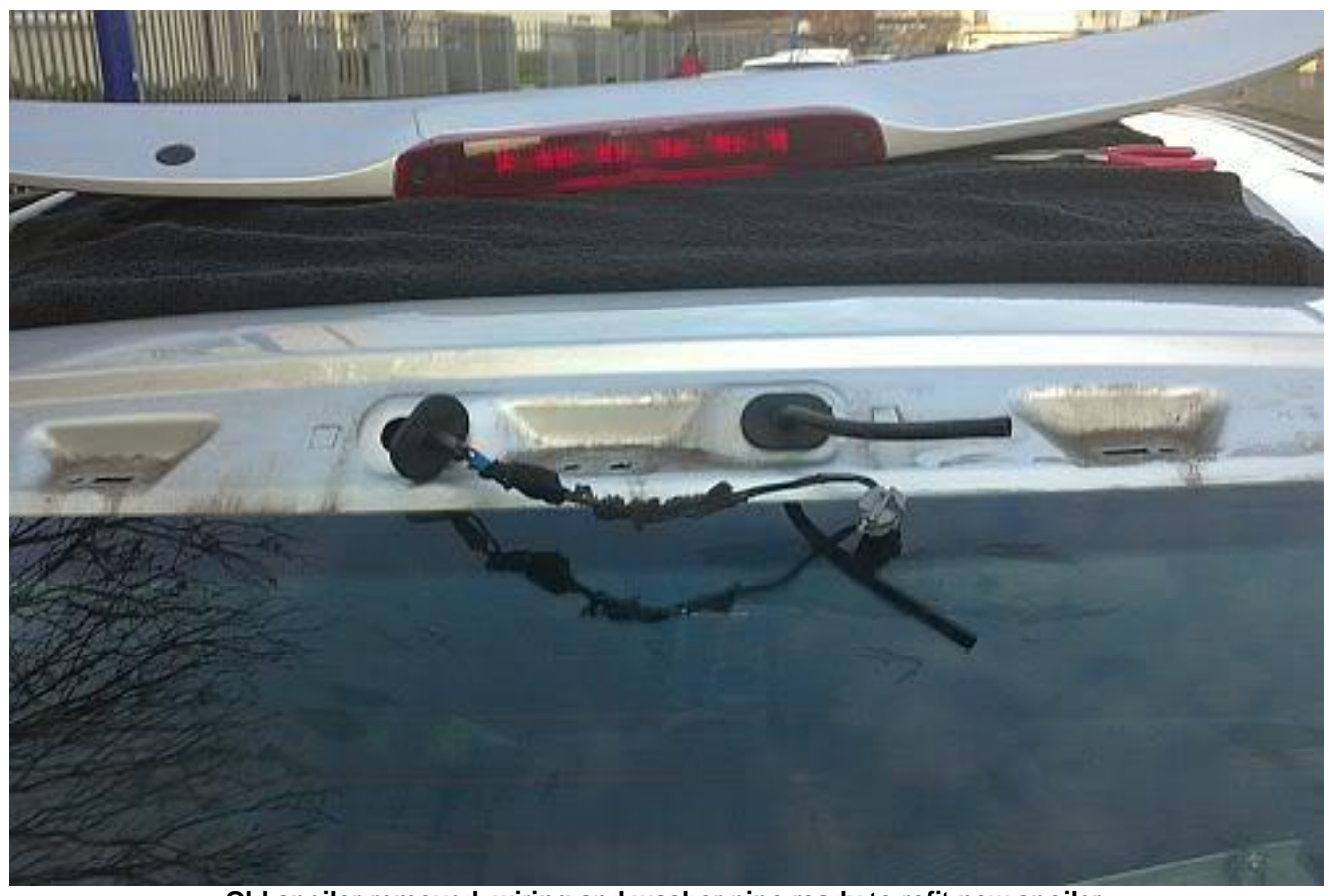
Old spoiler removed, wiring and washer pipe ready to refit new spoiler

Clean the area under the spoiler as it will be very dirty, I only gave it a quick wipe but will be sure to get the jet washer under there more often.