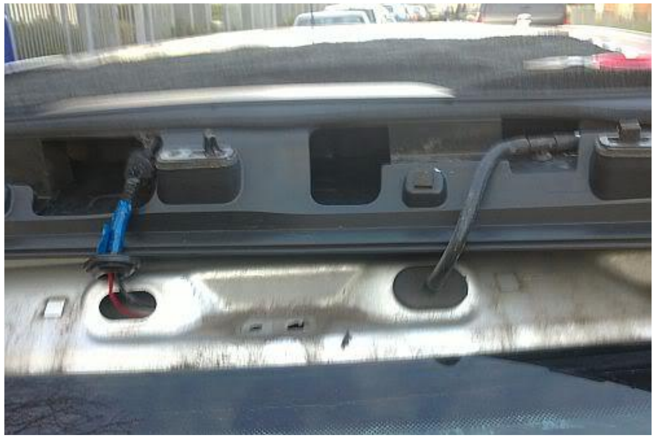
Underside of old spoiler showing bolt holes, washer pipe (right) and wiring (left) the blue tape is where I attached the wire for my rear badge brake LED light.

Set the horrible thing aside for emergencies or resale.