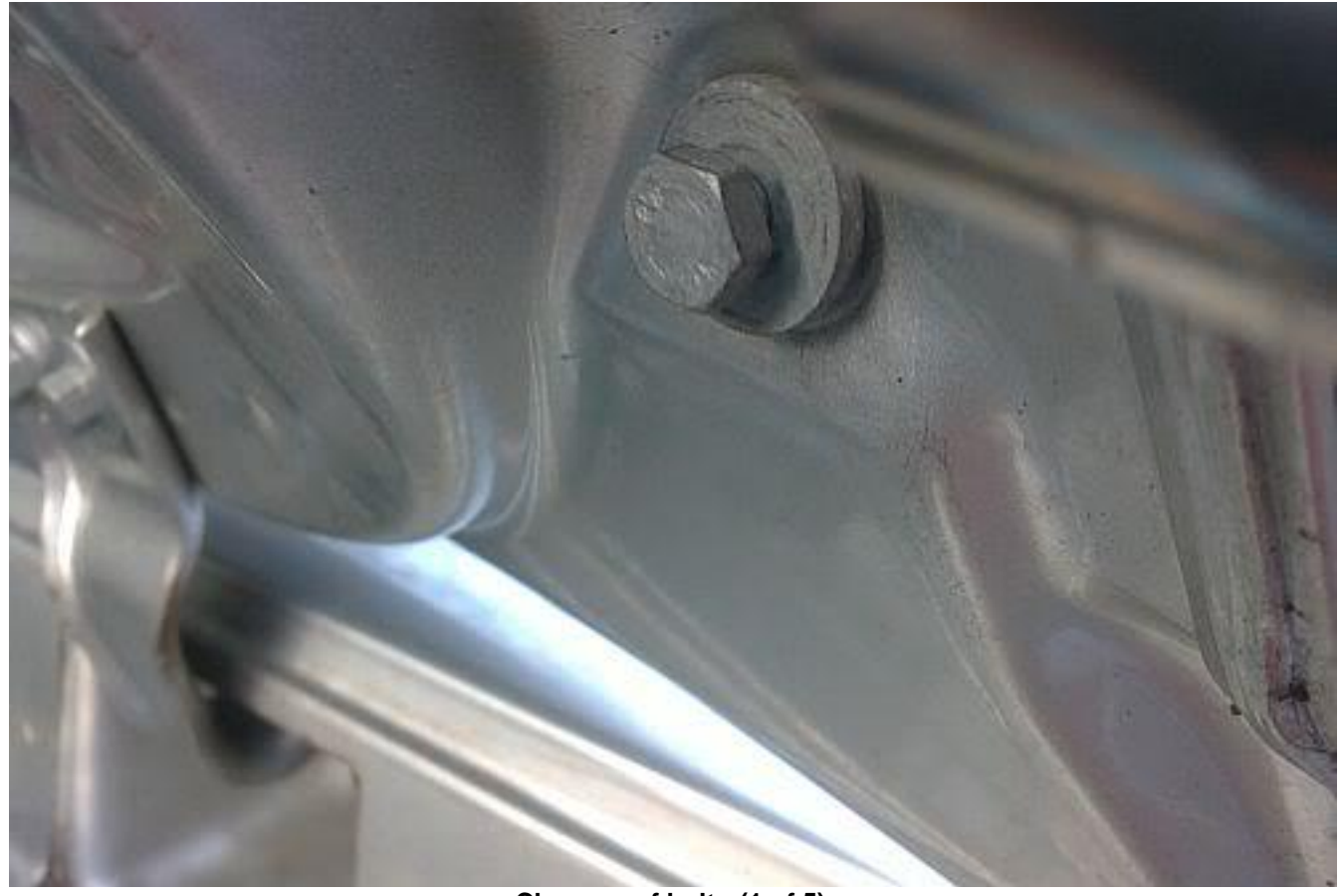
Close up of bolt - (1 of 5)

I recommend covering the roof under the spoiler with a cloth or towel.