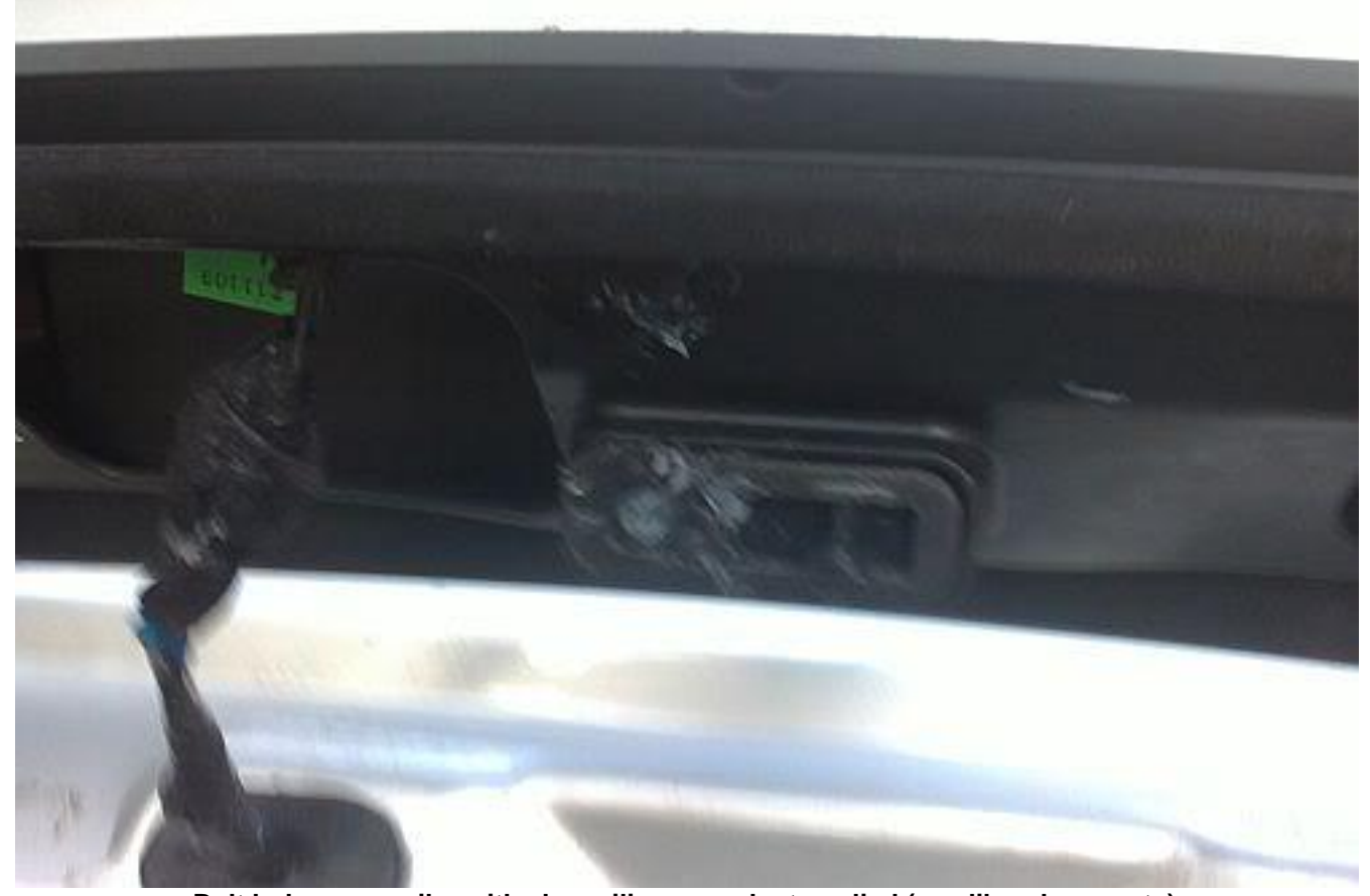
Bolt holes on spoiler with clear silicone sealant applied (use liberal amounts)

Next, offer up the replacement spoiler - use the clear Silicone around the bolt holes on the spoiler and the hatch so as to avoid water ingress.