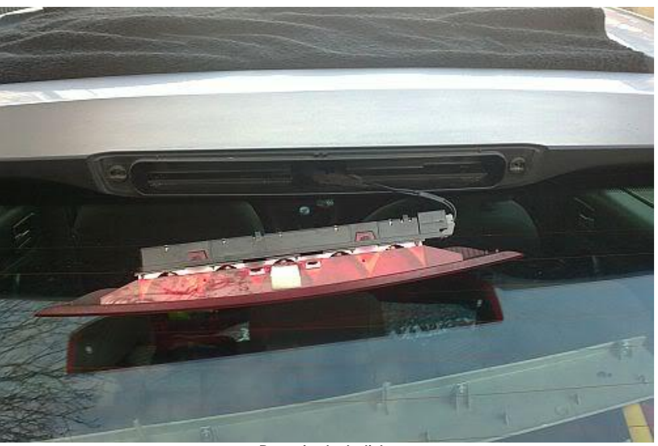
Removing brake light

Using the Torx screwdriver, unscrew and remove the brake light lens and bulbs, unclip the connector and pull off the washer pipe.