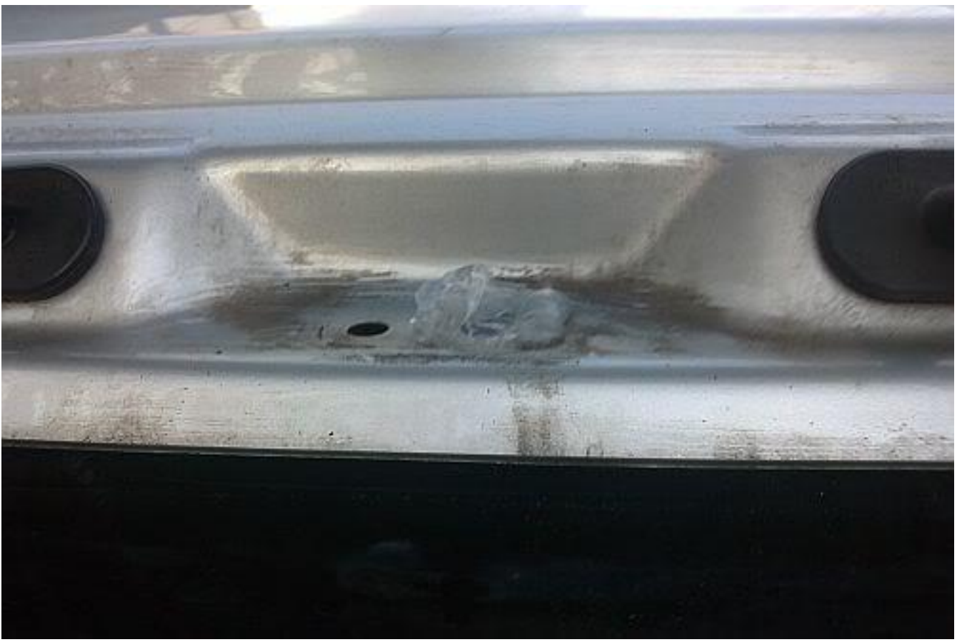
Bolt hole on hatch with clear silicone sealant applied

Push the wire back through the spoiler making sure that any grommets are firmly in place and reconnect the washer feed – (I nearly forgot).